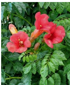
Trumpet vine flowers.

Notes: The species is often planted as an ornamental, due to the beautiful flowers.